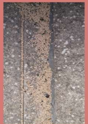
Frass of Drywood Termites