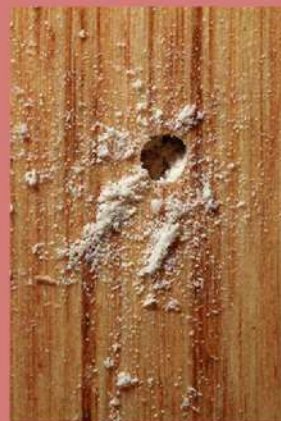
Frass of Powderpost Beetles

Beetles only attack hardwood, dry wood, and wood with high starch content. The adult beetles lay eggs only on bare or unfinished wood surfaces. Infestations can occur when beetles or larvae are transported into the building via wooden furniture. The larvae inflict damage as they create narrow tunnels within the wood while feeding.